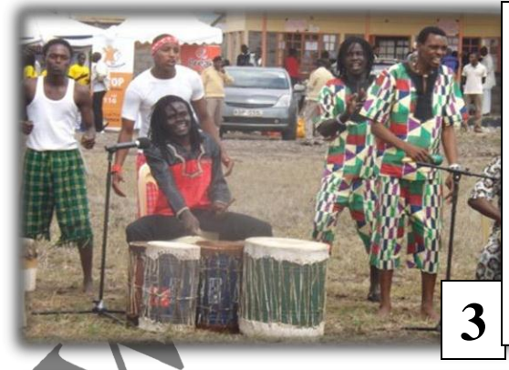
U-Tena Youth Organization

P.O. Box 2395-000200 Nairobi Kenya www.u-tena.org info@u-tena.org +254724842459 +254735001682